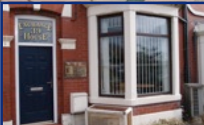
Exchange House, Bury